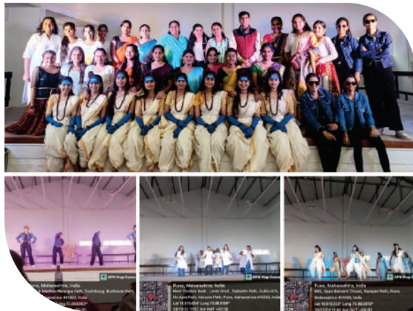
Dance Competition and participants