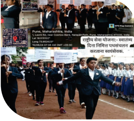
राष्ट्रीय स्वातंत्र्य दिना निमित्त पथ संचलन पथसंचलन करताना स्वयंसेवक.