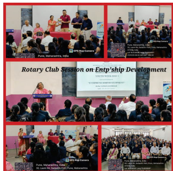
Rotary Club Session on Entrepreneurship Development in collaboration with the BBA Dept.