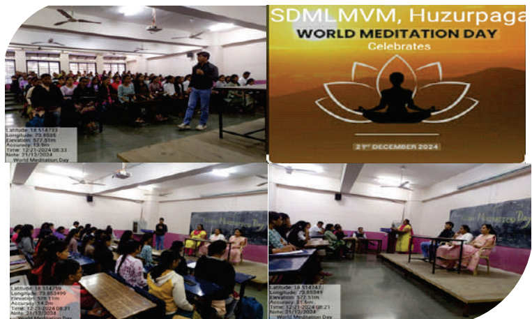
World Meditation Day