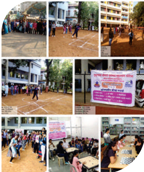
Krida Mahotsav (Intra Class Sports Competition)