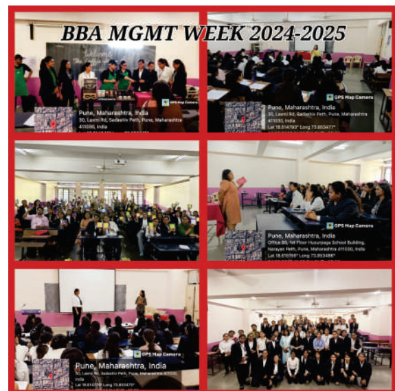
Management Week Sessions to enhance Personality Development and Employability Skills