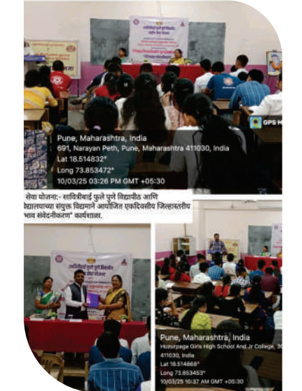
राष्ट्रीय सेवा योजना-सावित्रीबाई फुले पुणे विद्यापीठ आणि महाविद्यालयाच्या संयुक्त विद्यमाने आयोजित एकदिवसीय जिल्हास्तरीय लिंगभाव संवेदनीकरण कार्यशाळा.