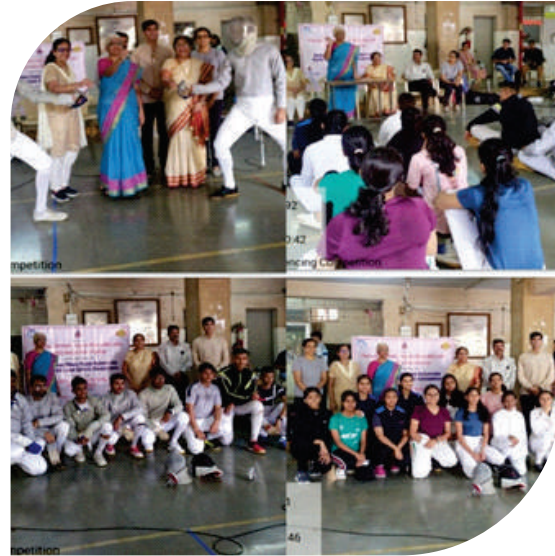
Fencing (23rd September 2024)