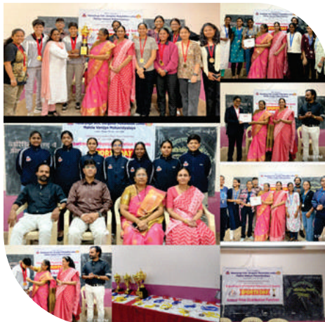
Sports Day (Annual Sports Prize Distribution)