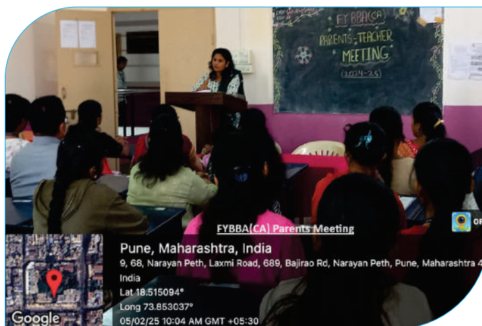
BBA(CA) Parents Meeting