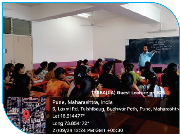
BBA(CA) IOT Guest Lecture