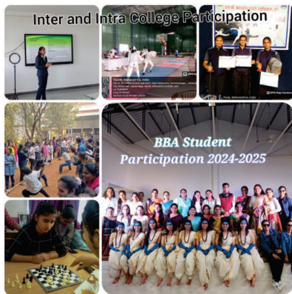
BBA Students Participation in Intra & Inter-collegiate competitions 2024-25(1)