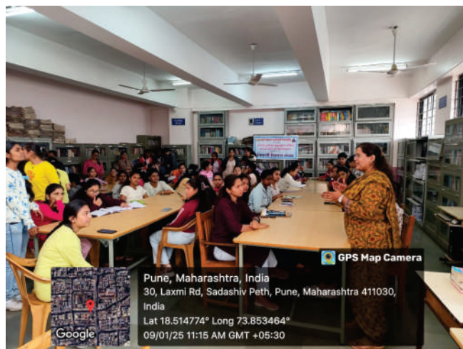
लेखक वाचक परिसंवाद