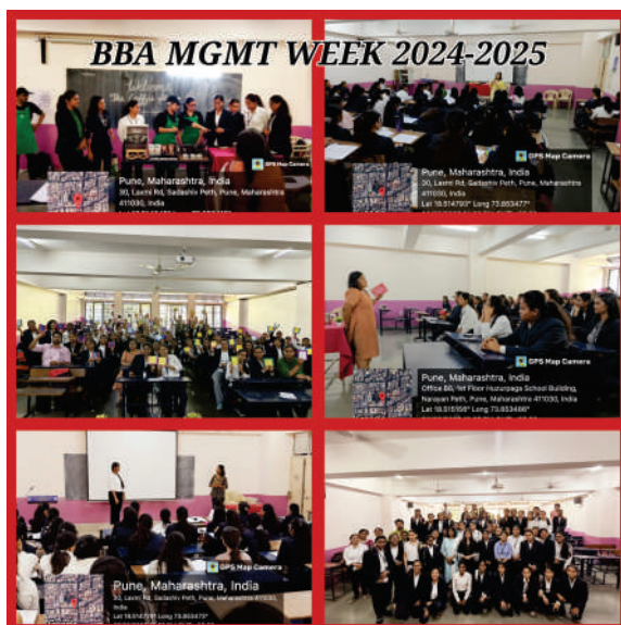
Management Week Sessions to enhance Personality Development and Employability Skills