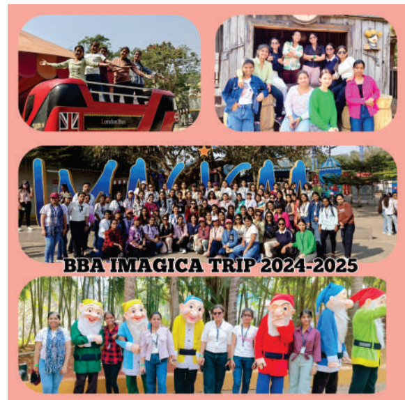
BBA Trip to Adlabs Imagicaa 2024-25 (1)