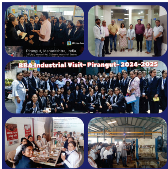
BBA Industrial Visit to Pirangut (2024-25)