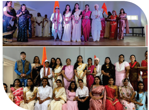
Fashion Show Competition