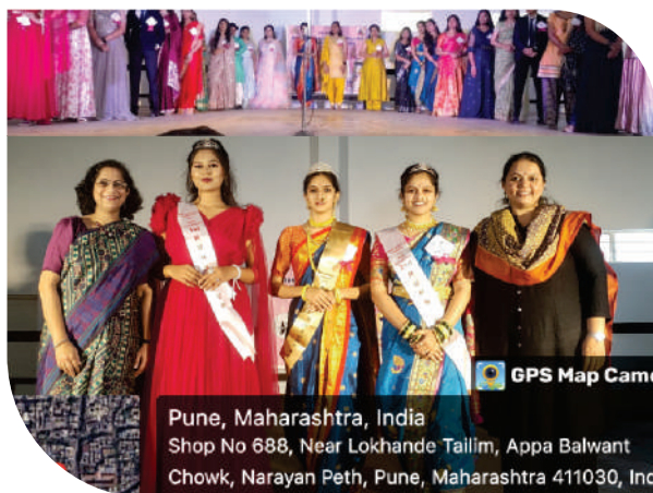
Miss Huzurpaga competitions & winners