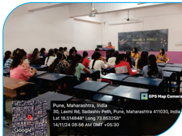
BBA(CA) Principal Address