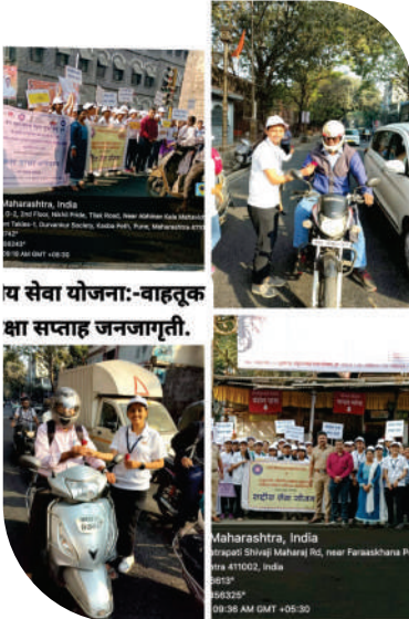
राष्ट्रीय सेवा योजना-वाहतूक सुरक्षा सप्ताह जनजागृती.