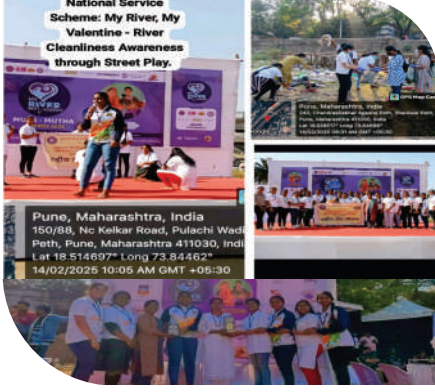
National Service Scheme My River, My Valentine - River Cleanliness Awareness through Street Play.