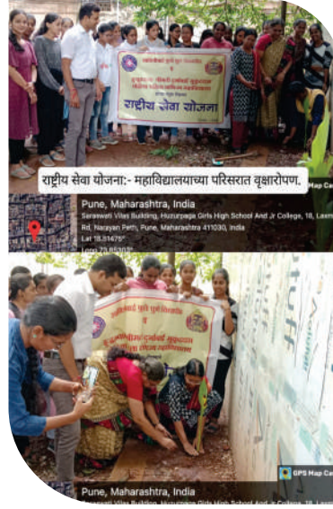
राष्ट्रीय सेवा योजना महाविद्यालयाचा परिसरात वृक्षारोपण