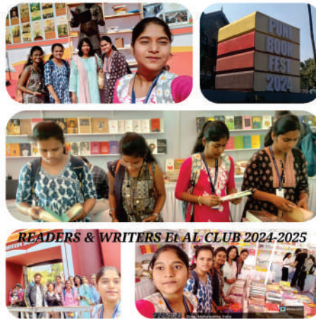
Reader's Writer's and Et Al Club visit to Book Festival at Fergusson College