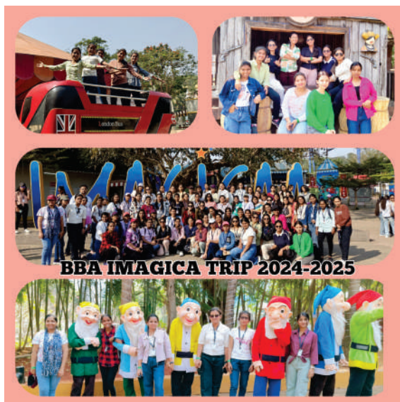
BBA Trip to Adlabs Imagicaa 2024-25