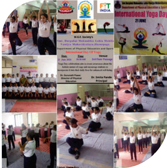
International Yoga day (21 st June 2024)