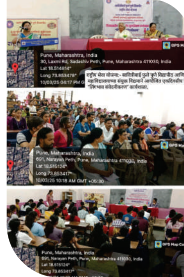
राष्ट्रीय सेवा योजना-सावित्रीबाई फुले पुणे विद्यापीठ आणि महाविद्यालयाच्या संयुक्त विद्यमाने आयोजित एकदिवसीय जिल्हास्तरीय लिंगभाव संवेदनीकरण कार्यशाळा.