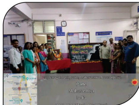
Celebration of Shivjayanti