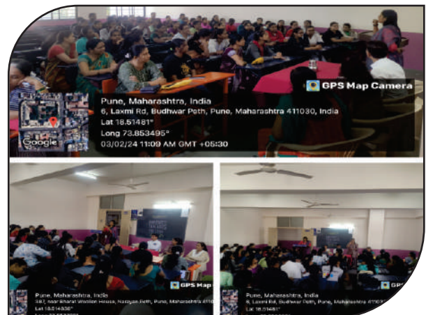
Parent Teacher Meeting