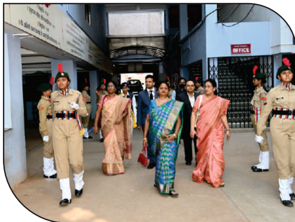
NAAC Peer Team Visit