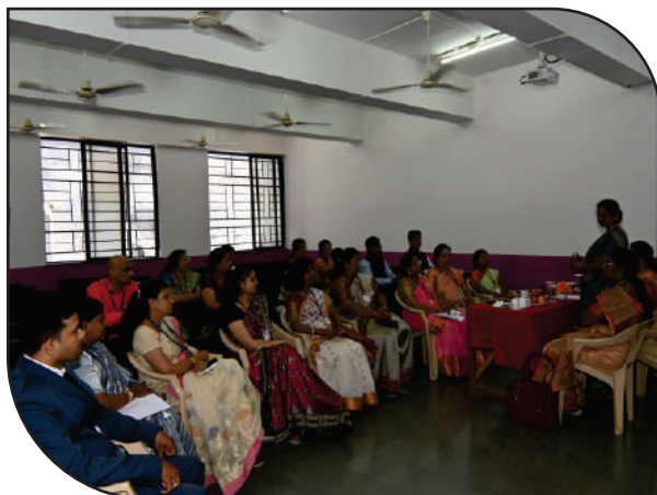
NAAC Peer team interacting with the staff