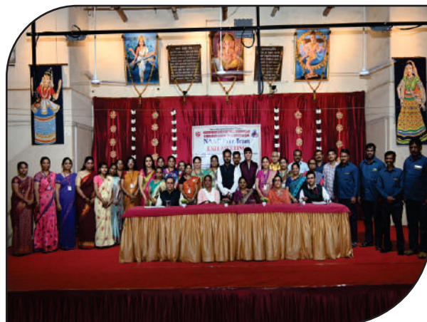
NAAC Peer team Exit Meeting