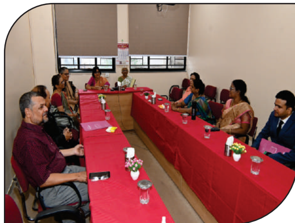
NAAC Peer team interacting with the Management Council