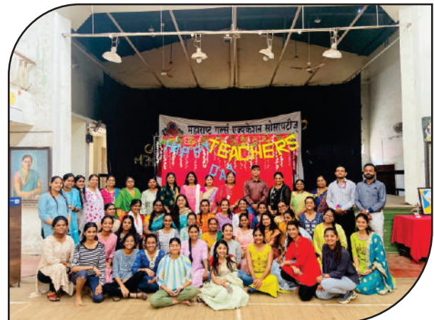
Celebration of Teachers Day