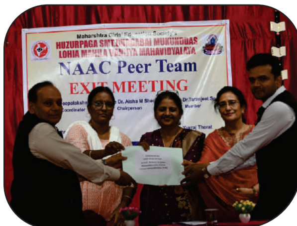
NAAC Peer team handing over the Report