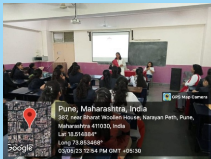
BBA Alumni - Aditi Babar Guiding Students