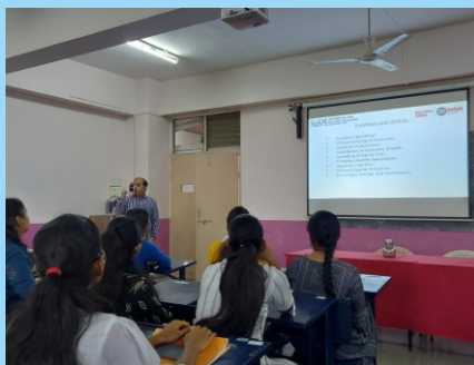
Financial Literacy Workshop