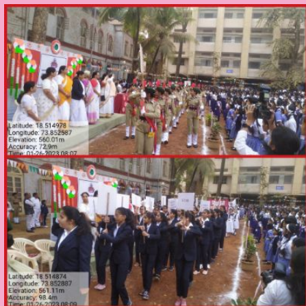
26th January 2023 celebration