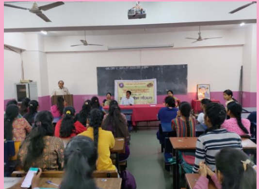
Savitaribai Phule Jayanti