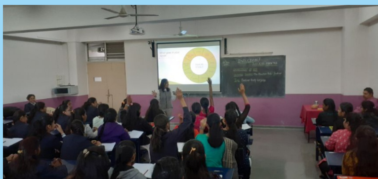
BBA induction Success Mantra Series Positive Body Language