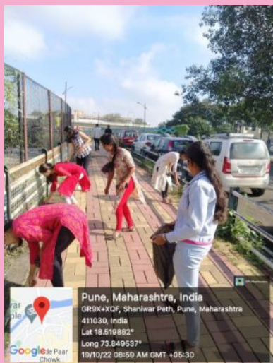
Plastic collection campaign