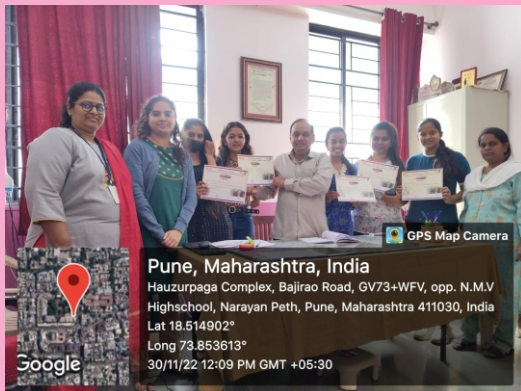
Winners of "Yuvak Mahotsav" Conducted at University Level