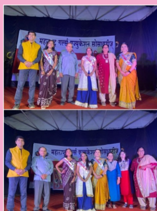
Winner Miss HSDMLMVM