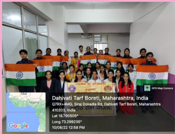
Every house Tricolor activity under Azadi ka Amrut Mahotsav