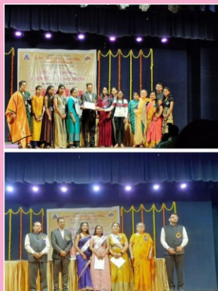
Annual Social Gathering & Prize Distribution