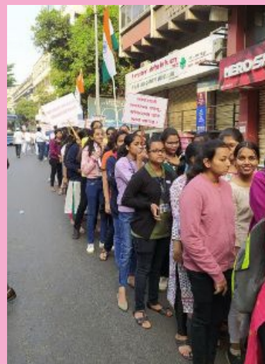
Constitution Honour Rally