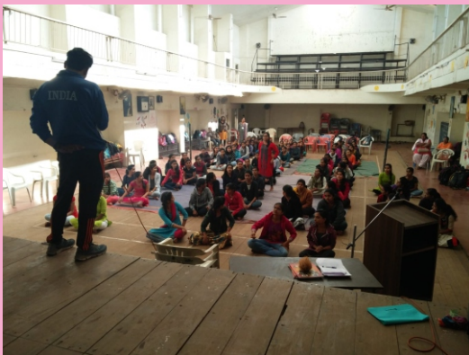
Self Defence Programe under Nirbhaya Kanya Abhiyan