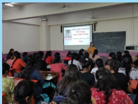
Training & Placement