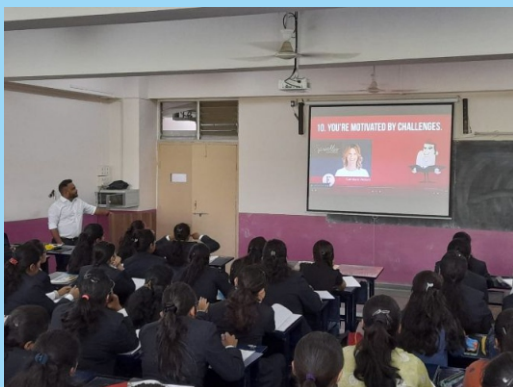
BBA Management Week