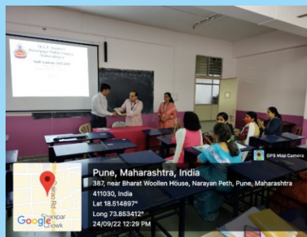
Staff Academy Activity