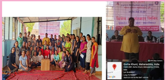
NSS Camp Activity